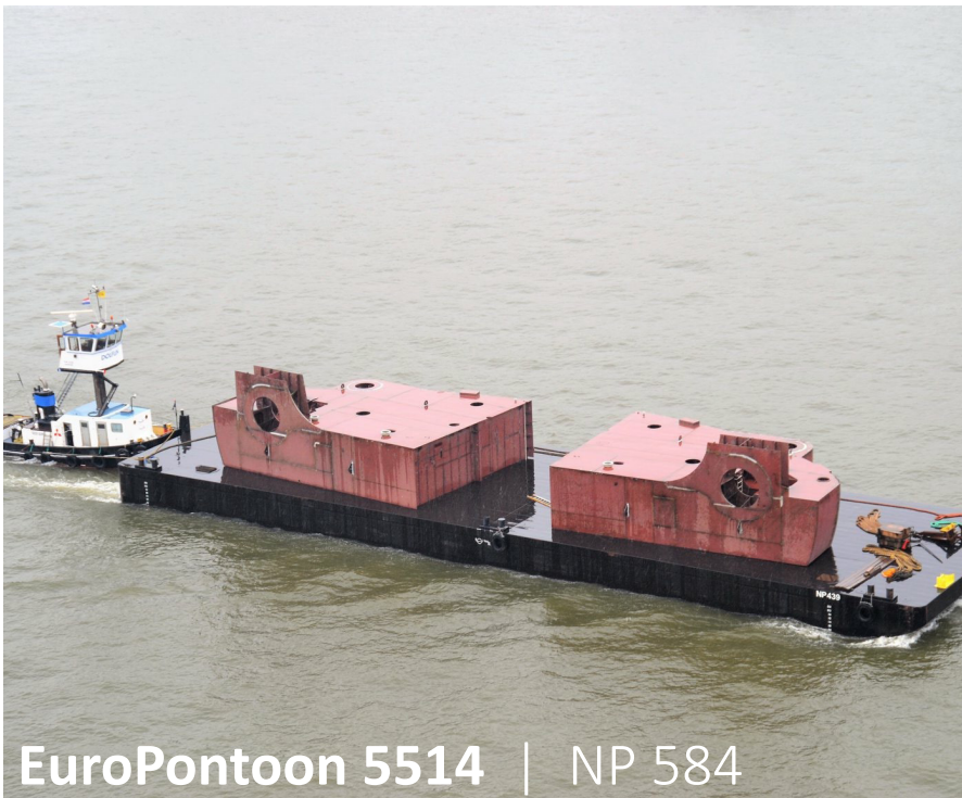
EuroPontoon 5514 | NP 584

Neptune has got various vessels and pontoons available for sale or charter. To fulfil your operational demands, Neptune offers a wide range of deck equipment, including accommodation units, mooring equipment and cranes.