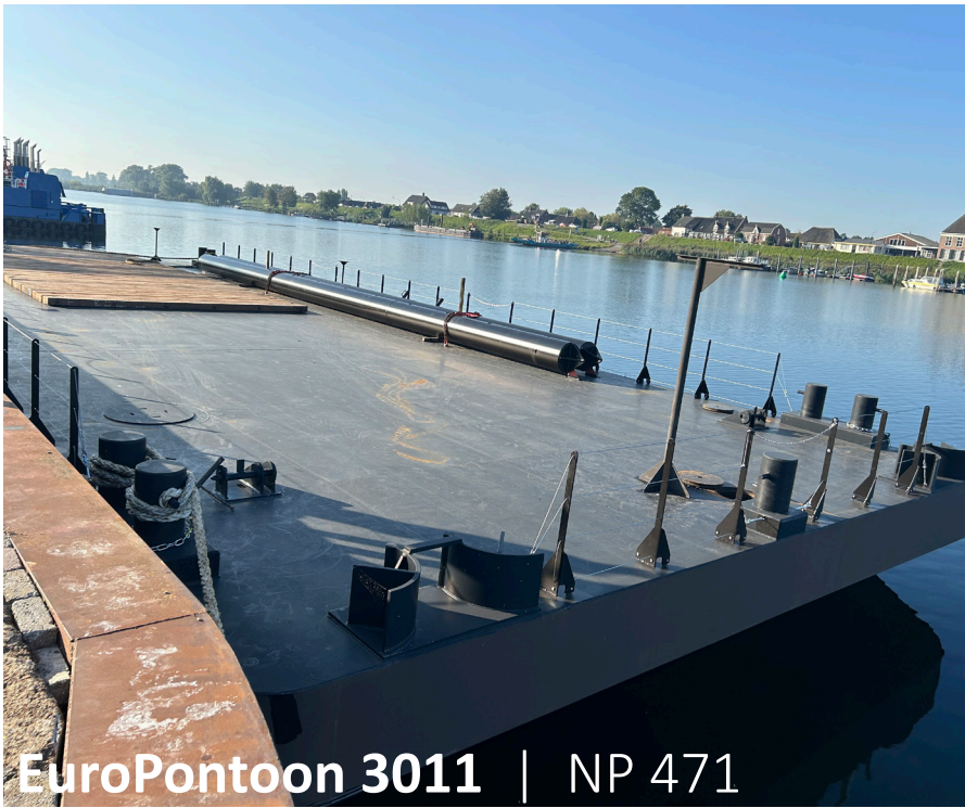
EuroPontoon 3011 | NP 471