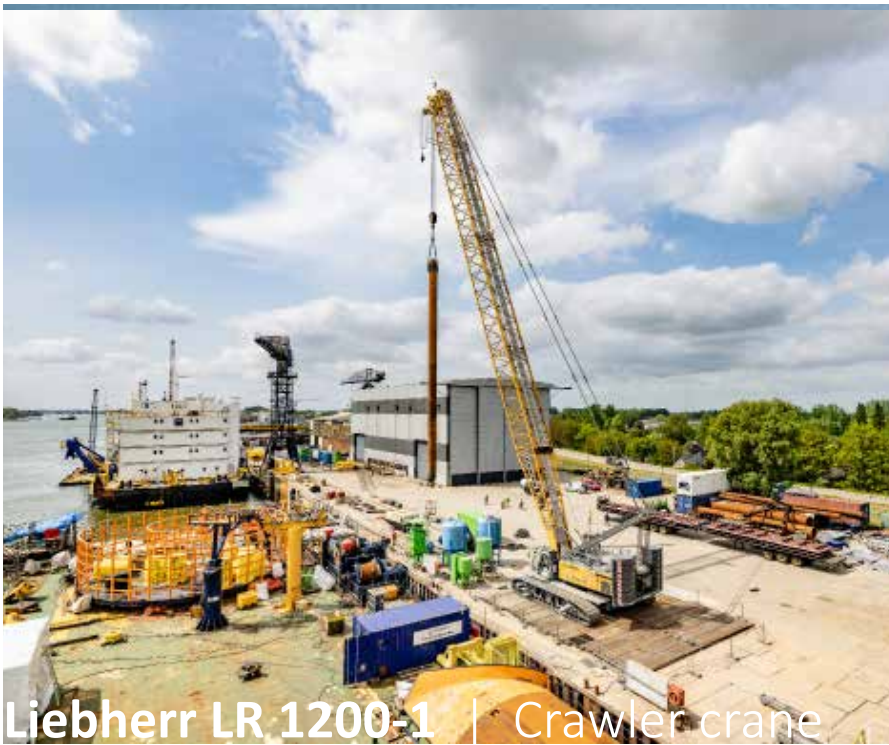
Liebherr LR 1200-1 | Crawler crane

The LR 1200 convinces with high performance and very compact design. Lifting capacities up to 220 tonnes are possible thanks to its particularly solid boom and jib system. Neptune Marine offers turnkey crawler cranes, available for charter on various pontoons.